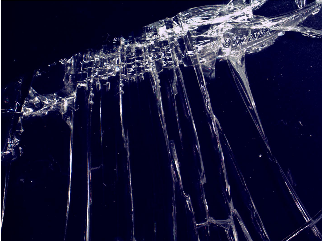
Figure 2 Close shot of a Class Device's fractured display

58. The Display Defect can manifest inside or outside of the return and warranty periods, but it typically causes damage before the 1-year warranty period is over. In some tablets the Display Defect manifests within the first days of use; in other cases the Display Defect may become apparent only after months of use.